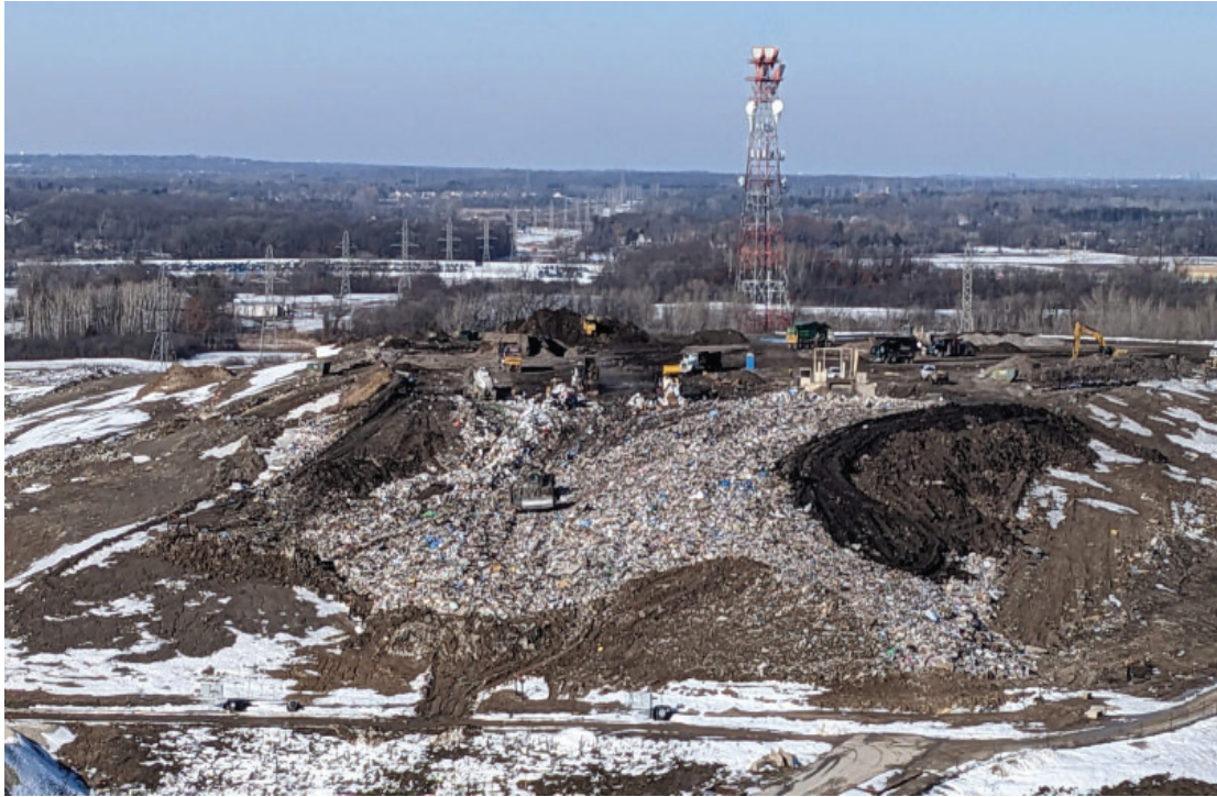
Phase 2b, South slope receiving waste