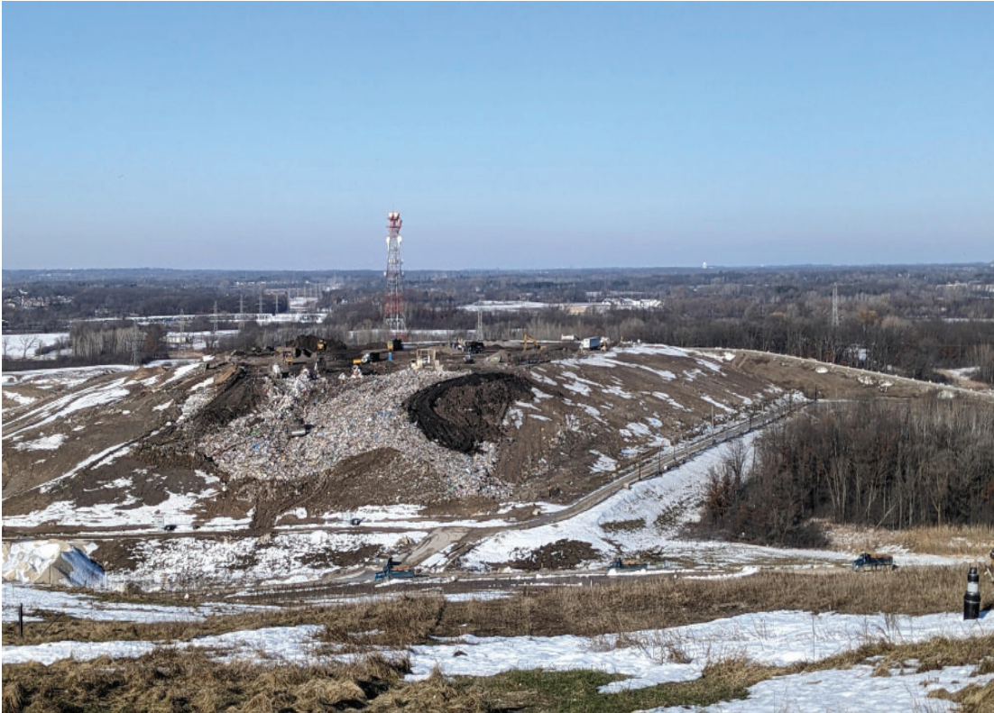
Overview of the East half of North Expansion West