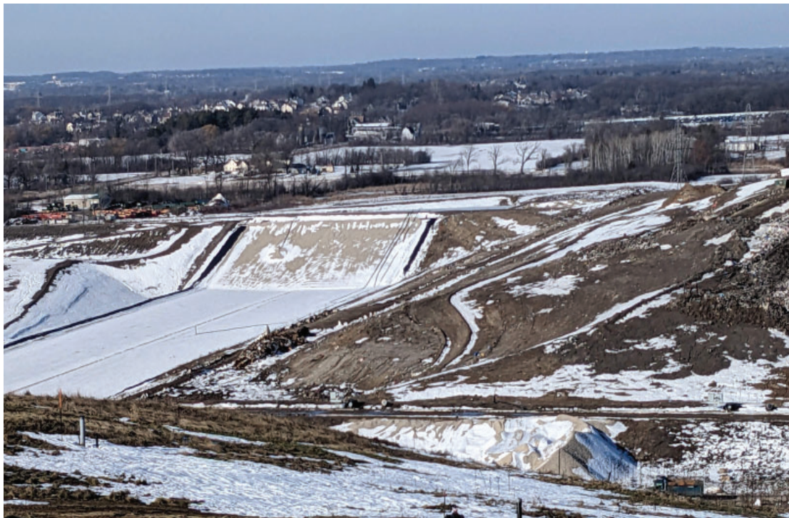
Overview, West half of North Expansion West