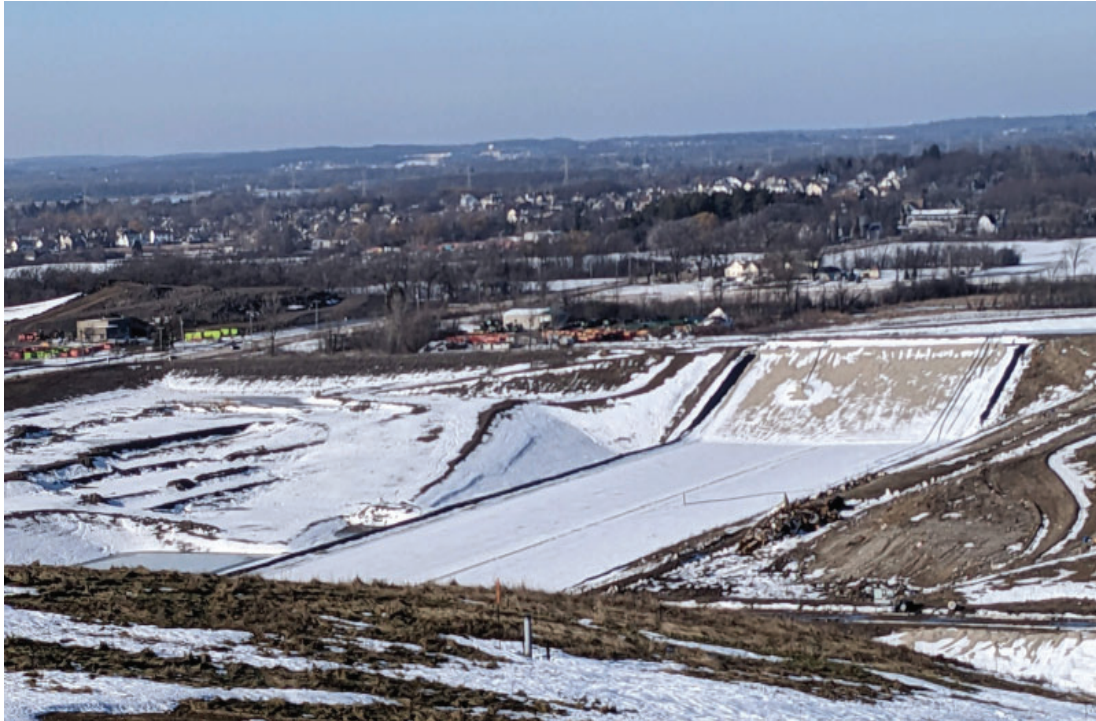
Phase 3 completed