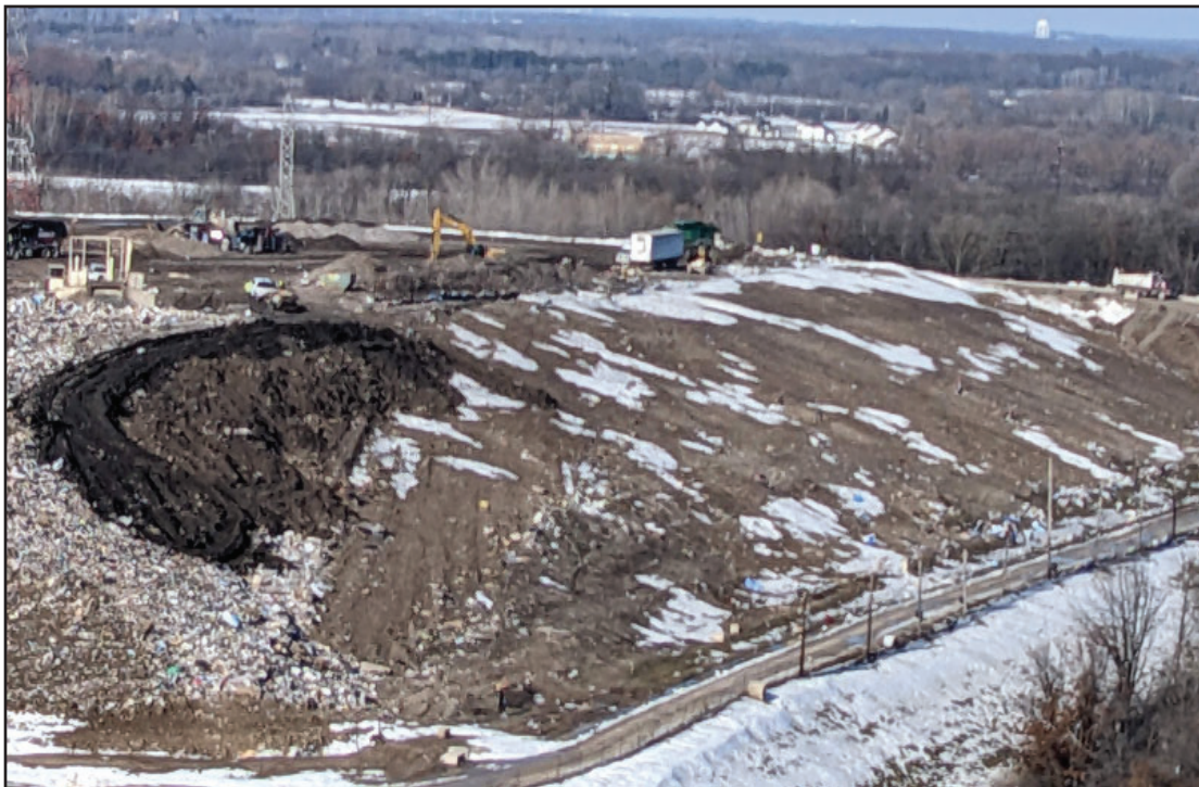
Cover and soils stockpile on Southeast corner of Noth Expansion West